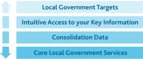
Figure 1: Local Government Information